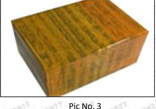
Pic No. 3 International express packaging: Wrapped with yellow tape after wrapping black protective film